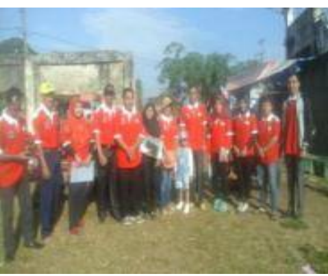
Photo 08: DistributionT-shirt to Gunung Raja for support 73<sup>rd</sup> Indonesian Independence day