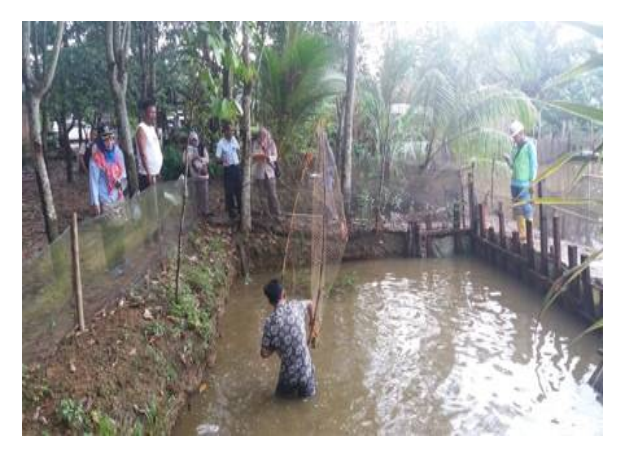
Photo 17 : Support fishery material to Fishery Group "Maju Bersama" in Banuayu village

On September 2018 CSR of PT TEL had distributed some tools to support traditional cake produce and packaging (mixer, seal machine and pan) to Joint Cake Business Group (Kube) ''Barokah'' – producer of egg cake in Tanjung village.