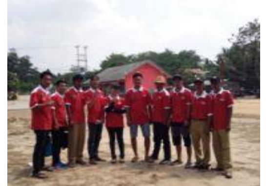
Photo 09 : Distribution T-shirt to Teluk Lubuk for support 73<sup>rd</sup> Indonesian Independence day