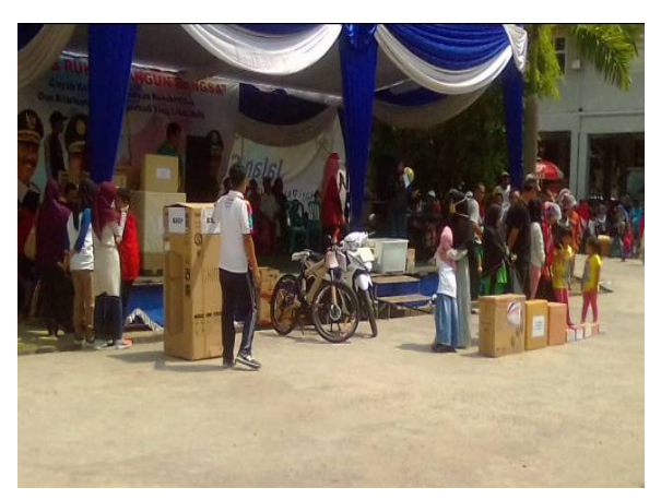
Photo 15 : Support National Transportation Day in Fun Walk event at Transportation Office of South Sumatera