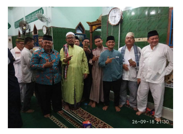
Photo 05: Islamic New Year event at Al-Ikhlas Mosque in Lubuk Raman village