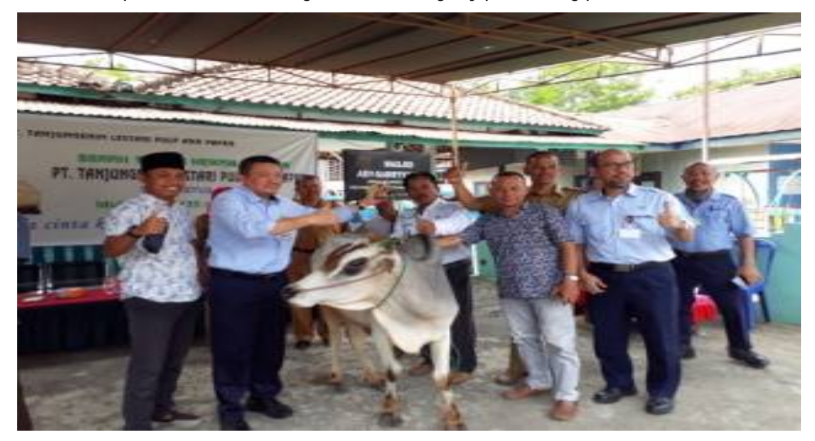
Photo 04 : Handover Ceremony of Eid Adha (qurban animal) in Muara Niru village. 10 cows and 20 goats distributed to 28 Village and 2 Sub District near PT TELPP.

Other religious program in September 2018 is commemorate the New Islamic Year (1 Muharram) event. By this event, PT TEL conduct religious lecture in 4 villages (Lubuk Raman, Kuripan Induk, Belimbing and Jemenang) by presenting preachers in this event.