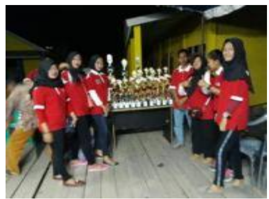
Photo 07: Distribution T-shirt to Banuayu for support 73<sup>rd</sup> Indonesian Independence day

For anniversary event in Rambang Dangku sub district, PT TEL support rental of tent, stage and music for Community night festival. Also for Muara Enim regency, PT TEL support rental of rigging stage and lighting and donate sarong and praying hijub (100 ea) for retired of army and police.