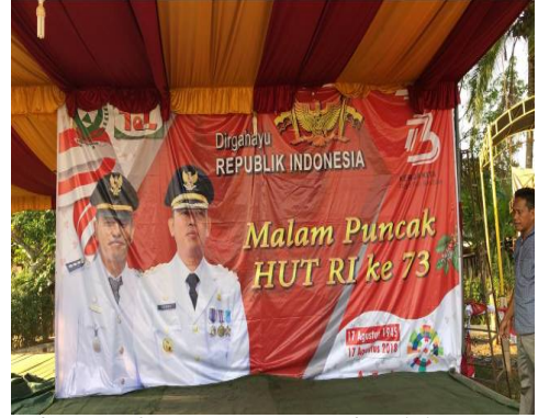
Photo 10 : Support tent, stage and music in Rambang Dangku Sub District