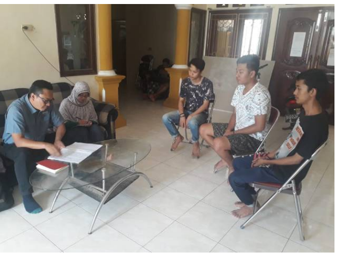
Photo 24 : Visitation to student of scholarship program at Polytechnic of Sriwijaya – Palembang

HR, LCD and Corporate Communication team had conducted visitation to student's scholarship program at ATPK (Technology Pulp and Paper Academy) Bandung and State of Polytechnic of Sriwijaya Palembang.