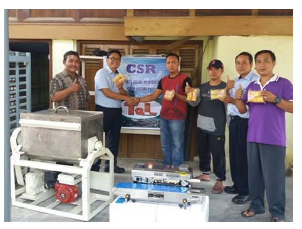
Photo 18: Support machinery to Kube Barokah in Tanjung village to increase production volume