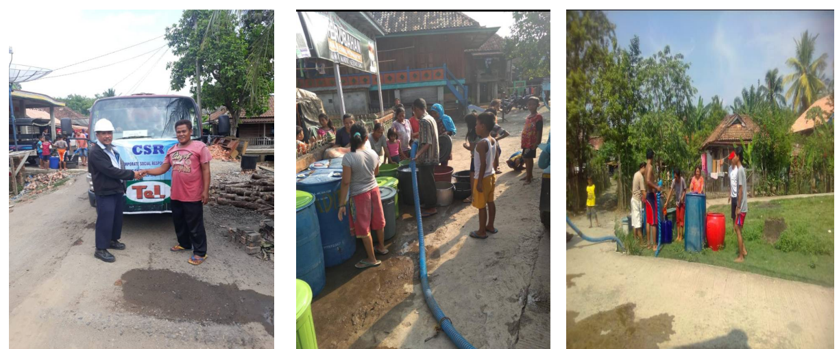
Photo 19 - 21 : Distribution clean water to community in Dalam village