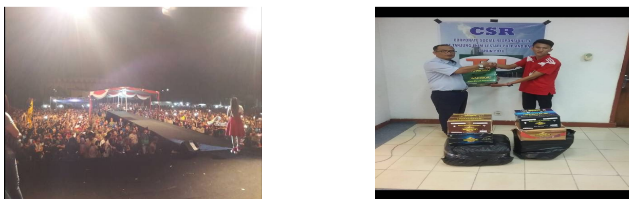
Photo 11 - 12 : Support rigging stage and lighting to Muara Enim regency, and sarong & praying hijub for retired of army/police personnel