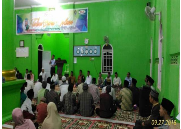
Photo 06 : Islamic New Year event at Attaqwa mosque in Belimbing village