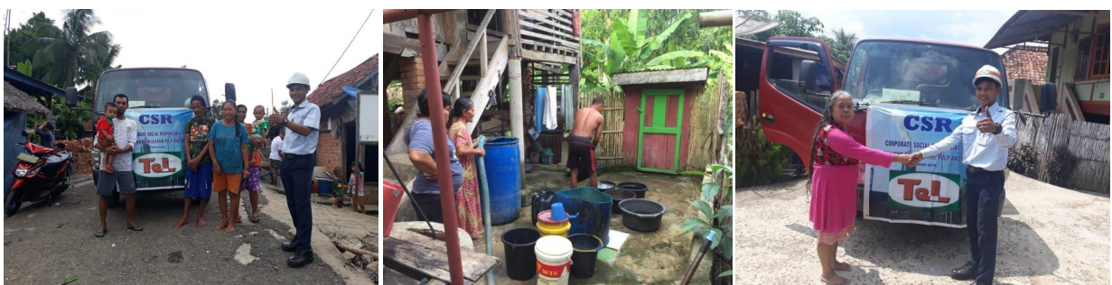
Photo 22 -23 : Distribution clean water to Kuripan Induk, Muara Niru and Kasih Dewa village