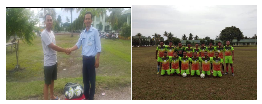
Photo : Support to football tournament event of the 19<sup>th</sup> Dwi Pangga Cup in Cavalry Battalion 5 – Karang Endah