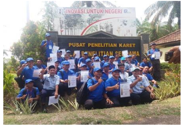
Photo: Training Rubber Plantation for 35 farmers from villages around of PT TEL