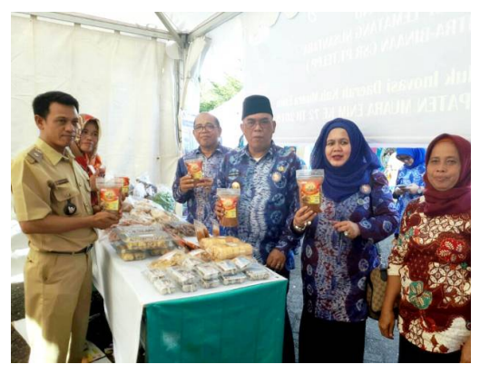
Photo : Head of Muara Enim Regent and his wife visit to stand of local economy group of PT TEL's partner