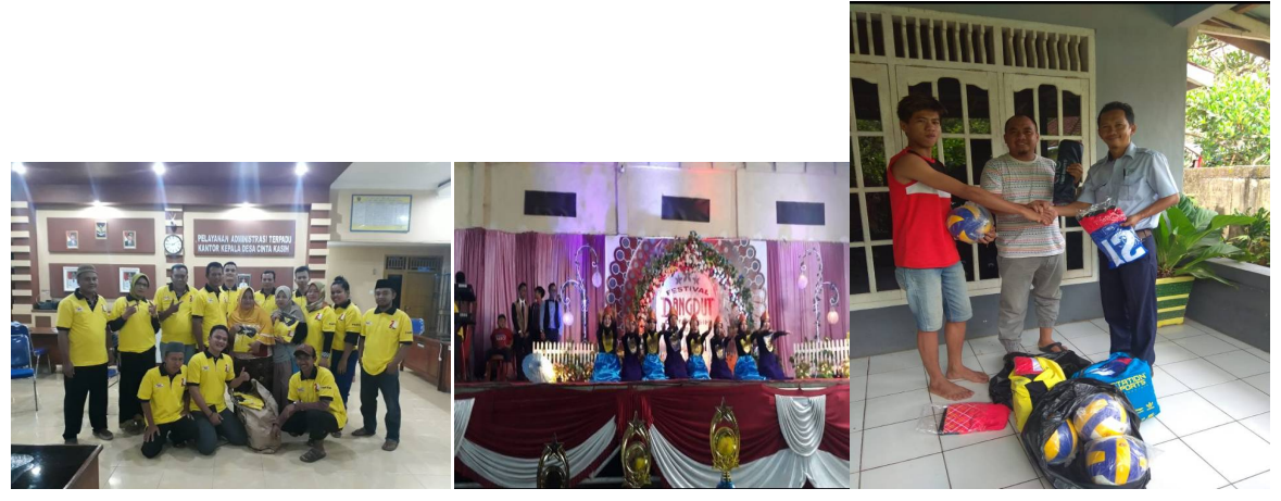
Photo 12-13 : Distribution T-shirt for committee of Youth Pledge day in Cinta Kasih village for Music Festival to Kasih Dewa village

• To commemorate the "Youth Pledge Day" which is celebrated every year on October 28, youth community in Cinta Kasih village conducted Music Festival for level of Sub District (Rambang Dangku, Belimbing and Gunung Megang). PT TEL support the event by distribution T-shirt for committee of Music Festival.