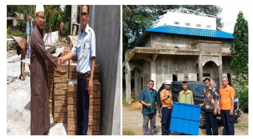
Photo : Distribution of material to support Islamic Boarding School Al Roiba in Muara Enim (left) and to renovation of mosque in Belimbing Jaya village (right)