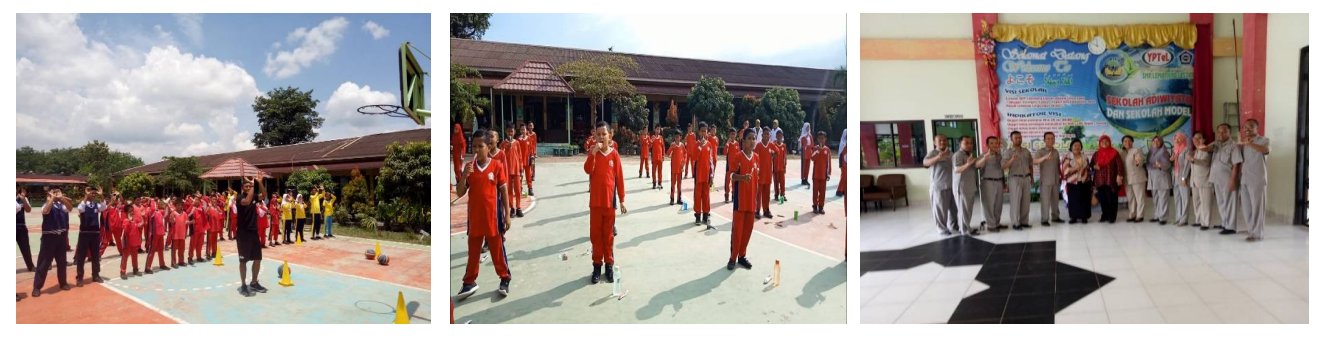
Photo: Socialization by coach NBA Jr, collective Toothbrush in primary school, and Accreditation Assessment in Junior High school