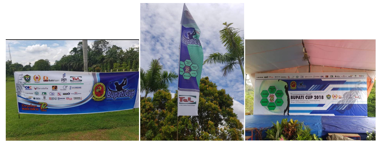
Photo .....: Sponsorship of PT TEL in Golf Tournament of Muara Enim Regent Cup 2018