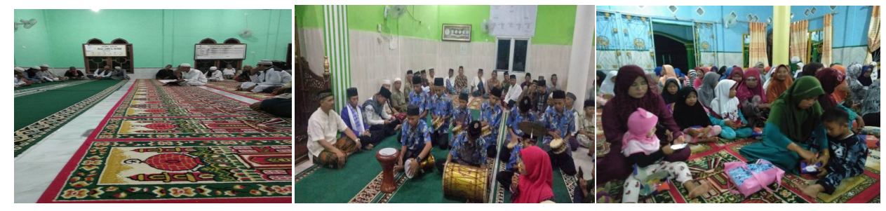
Photo 06 : Birth Prophet Muhammad SAWcommemoration in Muara Niru Village

Photo 07 : Birth Prophet Muhammad SAW commemoration in Dalam Village