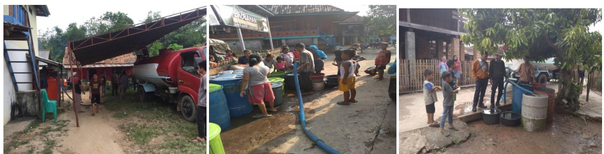
Photo 19 - 21 : Distribution clean water to community in Gerinam,, Dalam and Tanjung Menang village

Continue the distribution of clean water to community surrounding of PT TEL, in condition of Dry season (Period October - November 2018).