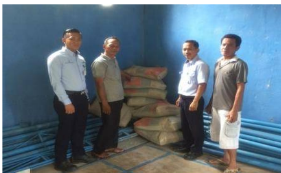
Handover material to Head Village of Kahuripan Baru