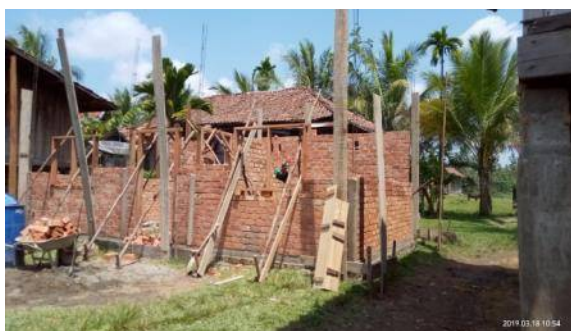
Progress construction of PAUD Ramadhan – Belimbing