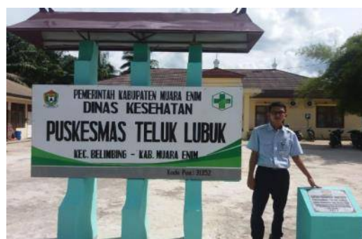
Construction of parking yard at Puskesmas Teluk Lubuk