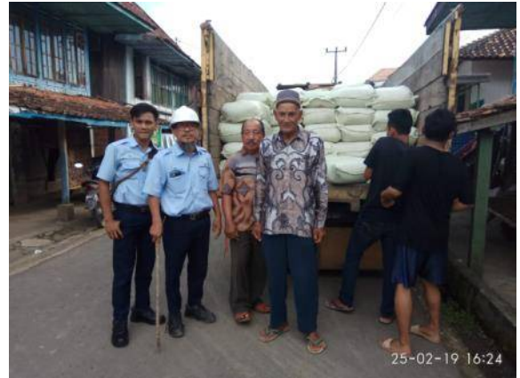
Distribution of seed to farmer