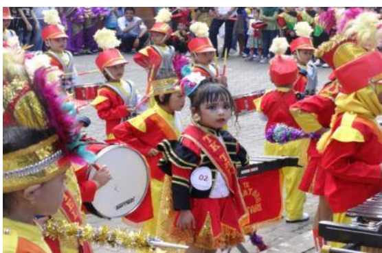
Participated in Drum band competition in Palembang