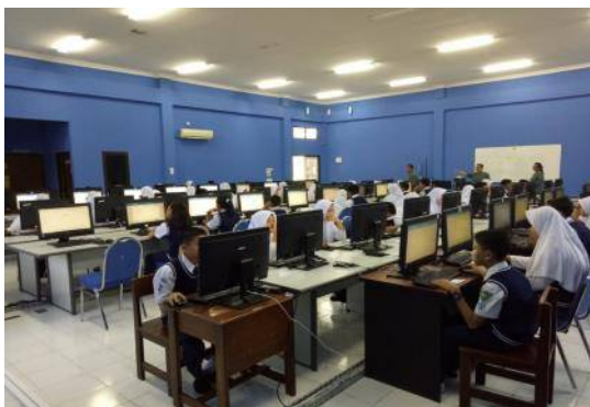
Try out for 9 th grade JHS students