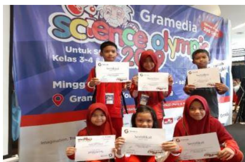
Participated in Science Olympic 2019 in Gramedia – Palembang