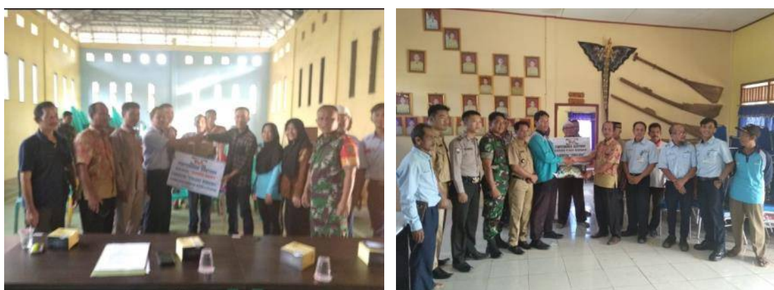
Symbolic distribution of sweet corn seed to farmer in Kuripan Induk and Kuripan Selatan (left), and rice seed for farmer in Banuayu village (right)

By this distribution of seed, farmers are expected to have seed reserves for the next several planting seasons.