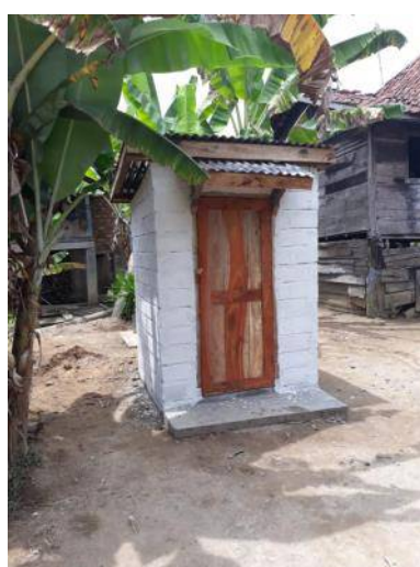
Progress construction of healthy toilet in Kuripan Induk village