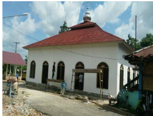
Renovation of Asy-Syarr'iyah mosque in Muara Niru