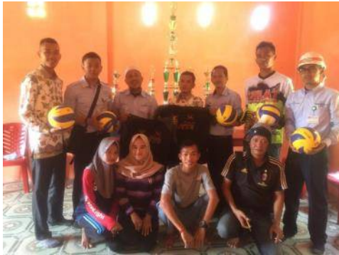
Handed over trophy and sport equipment to Belimbing Jaya