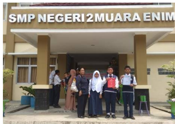
National Science Olympiad in Muara Enim