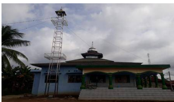
Construction of tower of Al Murayyah mosque in Kuripan Selatan