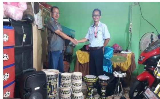
Handover materials for Marawis group in Dalam village