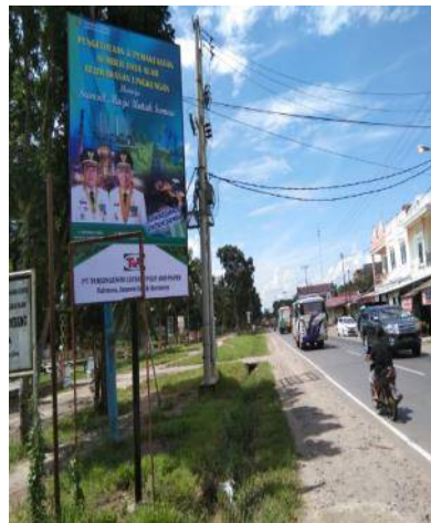
Billboard of South Sumatera Government vision and mission installed in Muara Enim area (2 units) and in Prabumulih area (2 units)