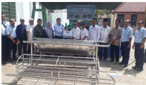
Symbolic distribution of burial equipment (Keranda and Bathing place) at Tebat Agung village