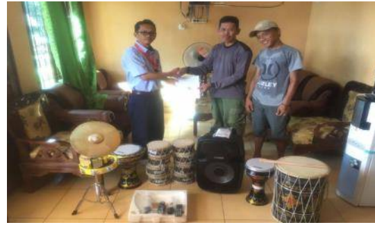
Handover materials for Marawis group in Tanjung Menang