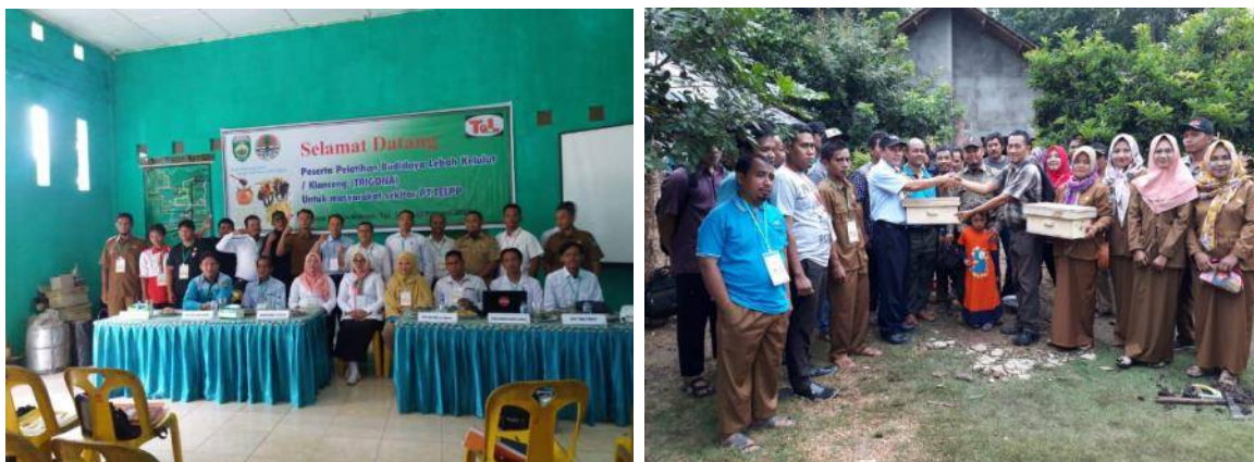
Training Kelulut honey bee for farmer group of Tebat Agung village and symbolic distribution of material for Kelulut honey bee cultivation

knowledge how to start and build Kelulut honey bee farm. Hopefully Kelulut honey bee becomes one of business opportunities for community.