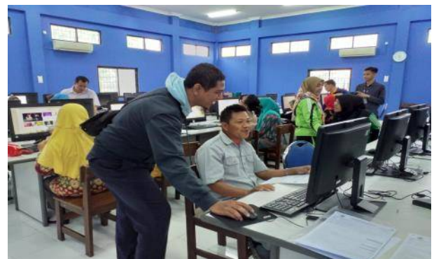
Socialization of tax income art 21 report