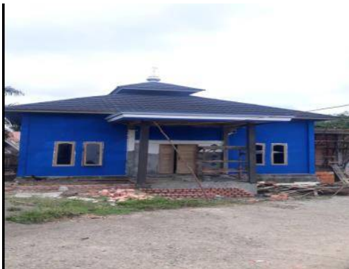
Progress construction of An Nidah mosque – Teluk Lubuk