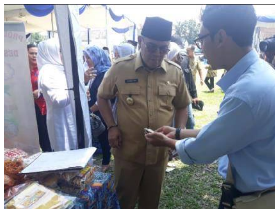
Participated in Muara Enim Expo for MTQ Fest in Muara Enim on March 18 – 21, 2019