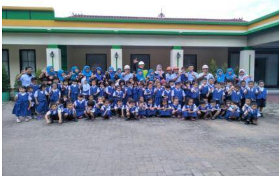
Study visitation to PT Tanjungenim Lestari Pulp and Paper