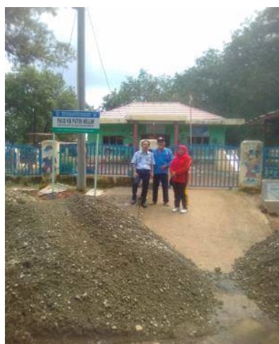
Handover material to PAUD Putri Melur – Dalam village