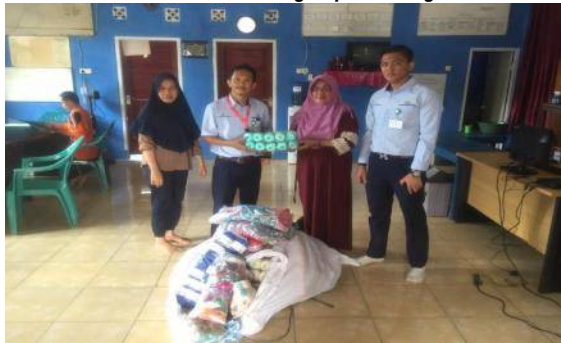
Handover of material for bag knitting activity for PKK in Lubuk Raman(left), and handed over of material for Lecah village (right)