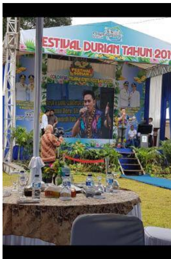
Launching of Colorful Muara Enim Festival