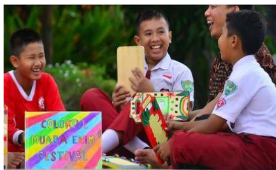
Achievement of Nation Green School (left), 1 st winner for Photo Contest in Durian Festival (above), School impact for Green School program (below)