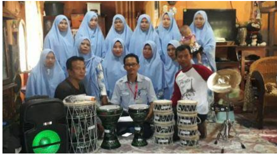
Handover materials for Marawis group in Bulang