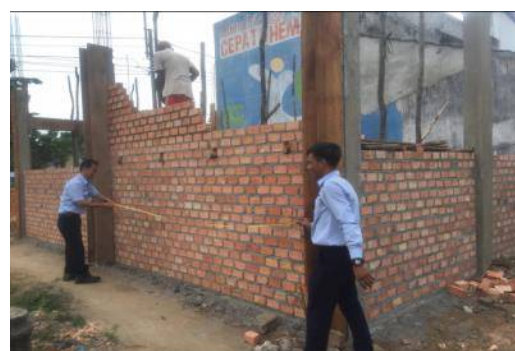
Monitoring construction of Bumdes building of Tebat Agung