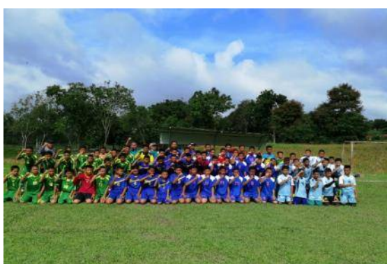
Gala Indonesia Students Competition