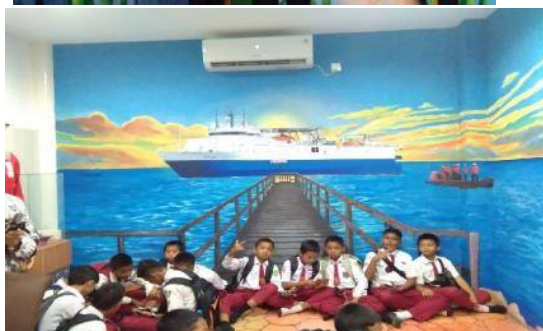
Study outdoor to Pertamina 3D Museum