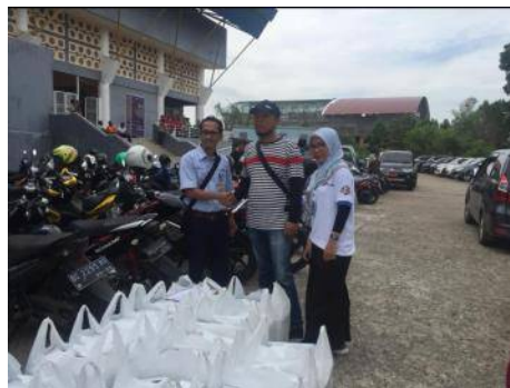
Handed over of meal box for Muara Enim (kick off football tournament of South Sumatera Governor Cup 2019)