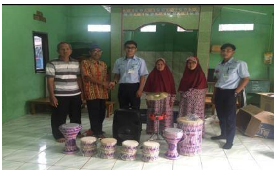
Handover materials for Marawis group in Banuayu