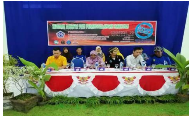
Narcotics hazard socialization