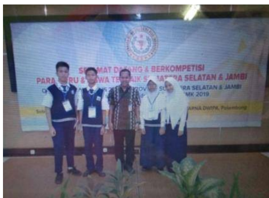
Science Olympic Plus 2019 in Palembang