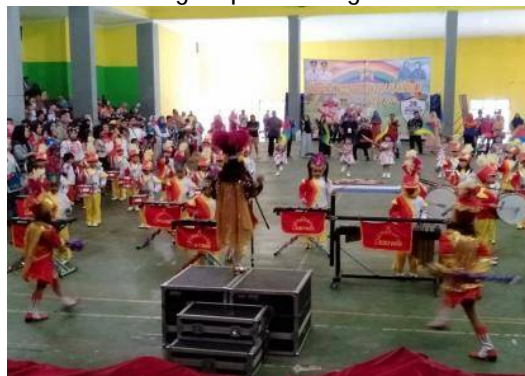
Perform in Drumband Competition in Prabumulih