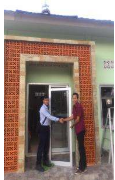
Handover materials to Al Muhajirin mosque in Cinta Kasih (left), Al Hidayah mosque in Gerinam village (center) and Salahuddin musholla at Tax Office of Prabumulih (right)