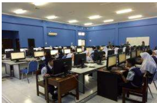
National exam based on computer at SMP Lematang Lestari