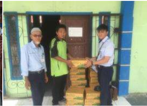
Distribution of Idul Fitri package to Darma Kasih (left) and Pangkalan Babat village (right)