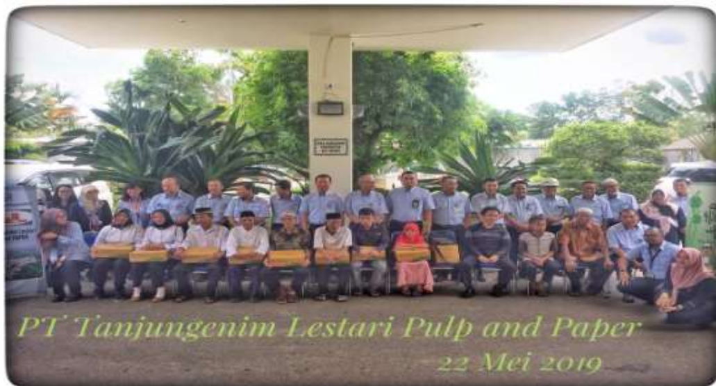
Symbolic distribution of Idul Fitri 1440 H/2019 pacakges on May 22, 2019 at Admin Building of PT TELPP

Besides for community surrounding of company, CSR PT TTELPP also support distribution Idul Fitri packages that conducted by government: Muara Enim Regency (75 packages), Police Resort of Muara Enim (75 packages) and Forestry Office of South Sumatera (100 packages). This year, CSR of PT TELPP had distributed 1,045 packages.