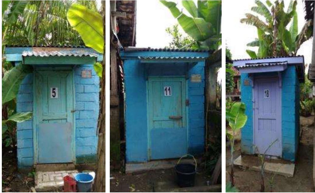
Some units of hygiene toilet in Kuripan Induk village