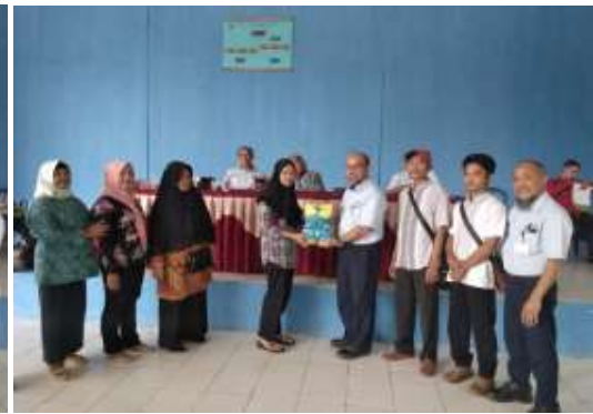
Symbolic distribution of elderly gym uniform on May 03, 2019 in Gerinam village