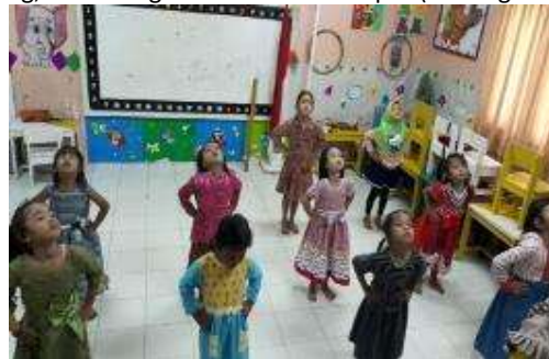
Some extracurricular at Kindergarten