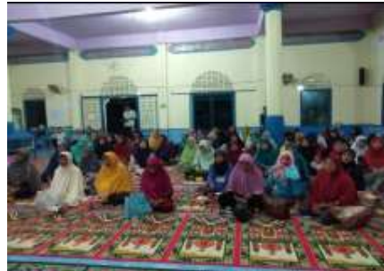
Isra Mi'raj in Kuripan Selatan (left) and in Kuripan Induk (right)