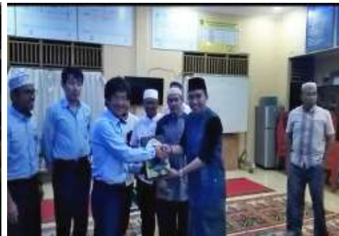
Symbolic distribution of Moslem cloth and sarong package to Jemenang village (left) and Cinta Kasih village (right) on May 08 – 09, 2019