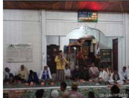
Isra Mi'raj in Muara Niru village (left) and Banuayu village (right)