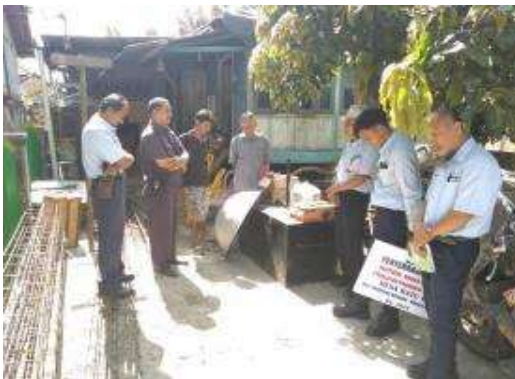
Handover of materials and equipment to Galang producer of tempe and tofu in Baturaja village