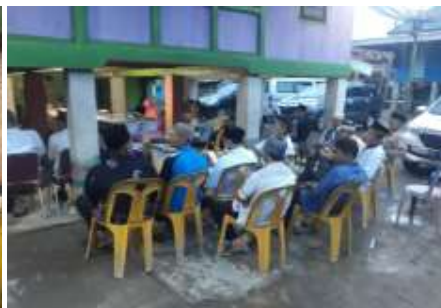
Safari Ramadhan in Tebat Agung (left) and Kuripan Selatan (right) on May 15, 2019