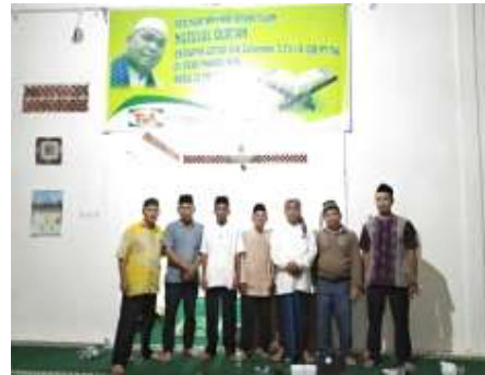
Nuzulul Qur'an in Muara Niru village (Ust Didi Zulkarnain)