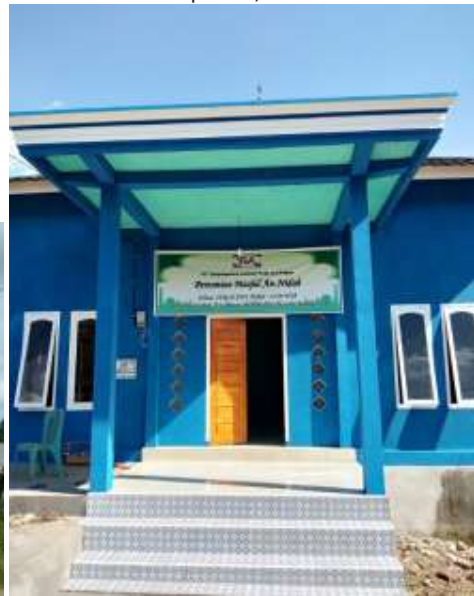
An-Nidah mosque in Teluk Lubuk village