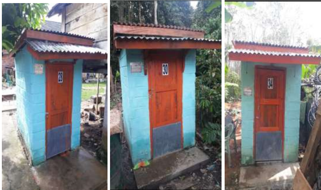
Hygiene toilet in Gerinam village