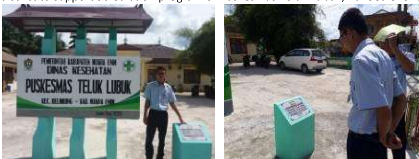
Parking area at Puskesmas Teluk Lubuk