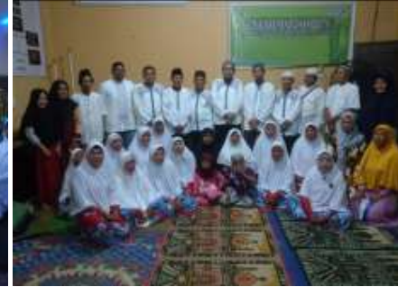
Safari Ramadhan in Cinta Kasih village (left) and Tanjung Menang village (right) on May 09, 2019