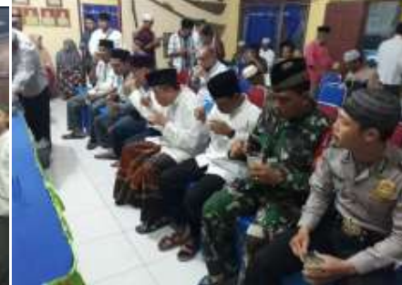
Safari Ramadhan in Dalam village (left) and Banuayu village (right) on May 14, 2019