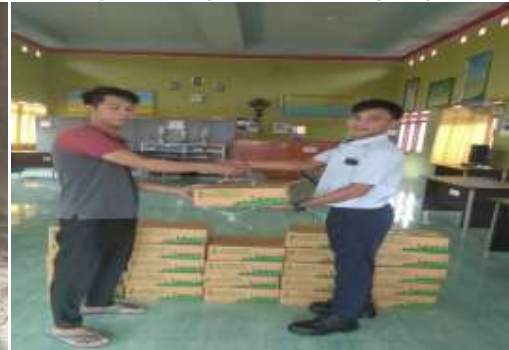
Idul Fitri package distribution to Belimbing village (left) and Bulang village (right)