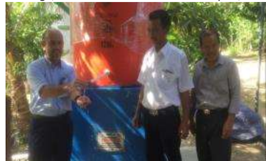
Handed over of drill well in Pangkalan Babat village