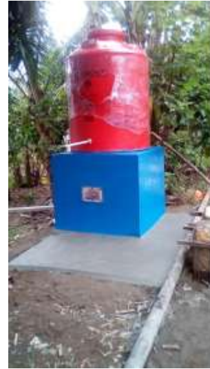
2 units of drill well in Pangkalan Babat village, Rambang Niru Sub District