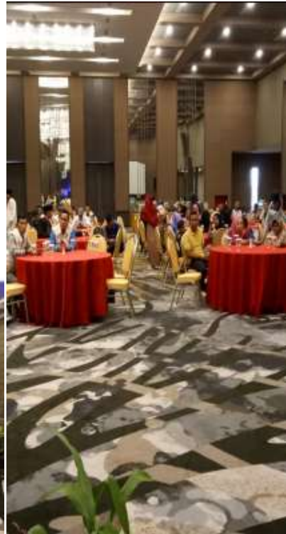
Gathering and breakfasting event of Trombhosite Blood Donor Community with cancer sufferer