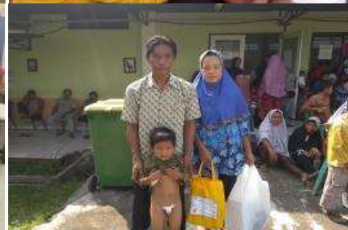
Mass circumcision event on June 25, 2019 that participated by 130 children from 16 villages surrounding of PT TEL