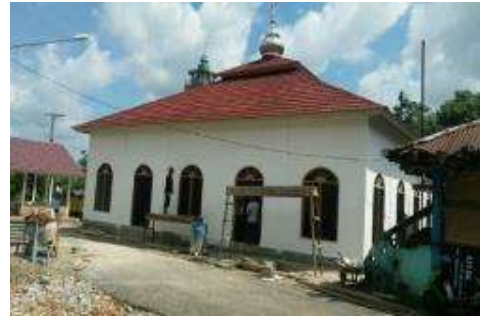
Renovation of Asy-Syarriyah mosque in Muara Niru village