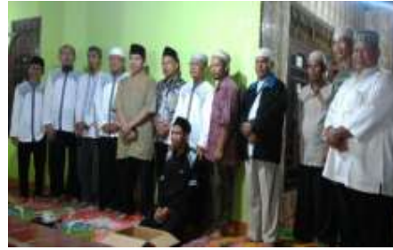
Safari Ramadhan in Kasih Dewa village (left) and in Jemenang village (right) on May 08, 2019