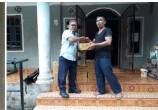
Idul Fitri package distribution to Beruge (left) and Dangku village (right)