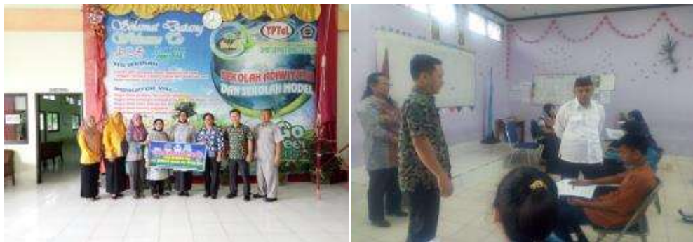
Visitation of Women Empowerment and Child Protection Office (left) Education and Culture Office of Muara Enim (right)