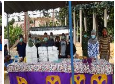
Post of covid-19 at Beruge (left), Bulang (center) and Belimbing village (right)