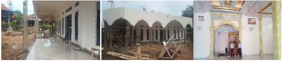
Progress construction of Al Hikmah mosque in Dalam village