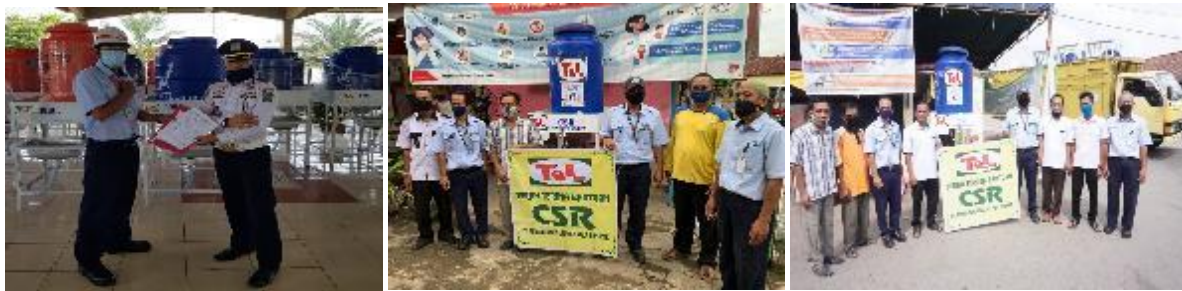
Distribution of water tank and handwashing facilities to Prabumulih (left), Darma Kasih (center) and Siku village (right)

Distribution of cloth mask (non medic mask) to the community at 28 villages Area 1-3 at 3 sub districts, institution and government (Muara Enim, Prabumulih and South Sumatera). Until June 2020, it had been distributed around 28,000 pcs of cloth mask.