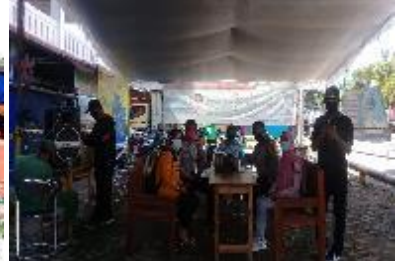
Post of covid-19 at Kahuripan Baru (left), Muara Niru (center) and Tebat Agung (right)