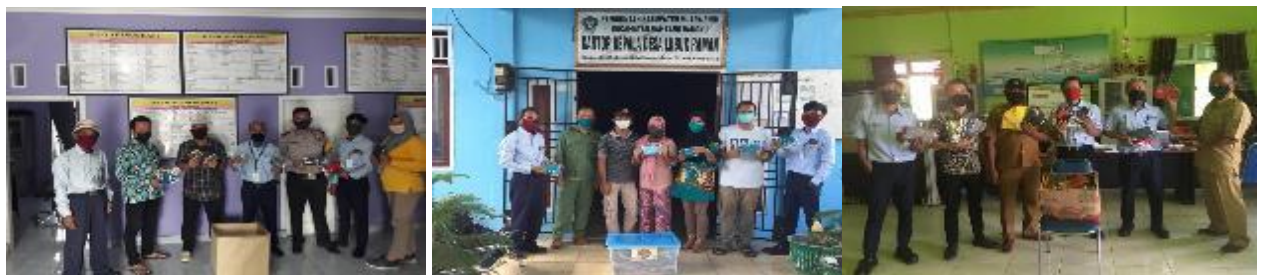
Distribution of cloth mask to Kasih Dewa (left), Lubuk Raman (center) and Tebat Agung village (right)

Distribution of cloth mask (non medic mask) to the community at 28 villages Area 1-3 at 3 sub districts, institution and government (Muara Enim, Prabumulih and South Sumatera). Until June 2020, it had been distributed around 28,000 pcs of cloth mask.