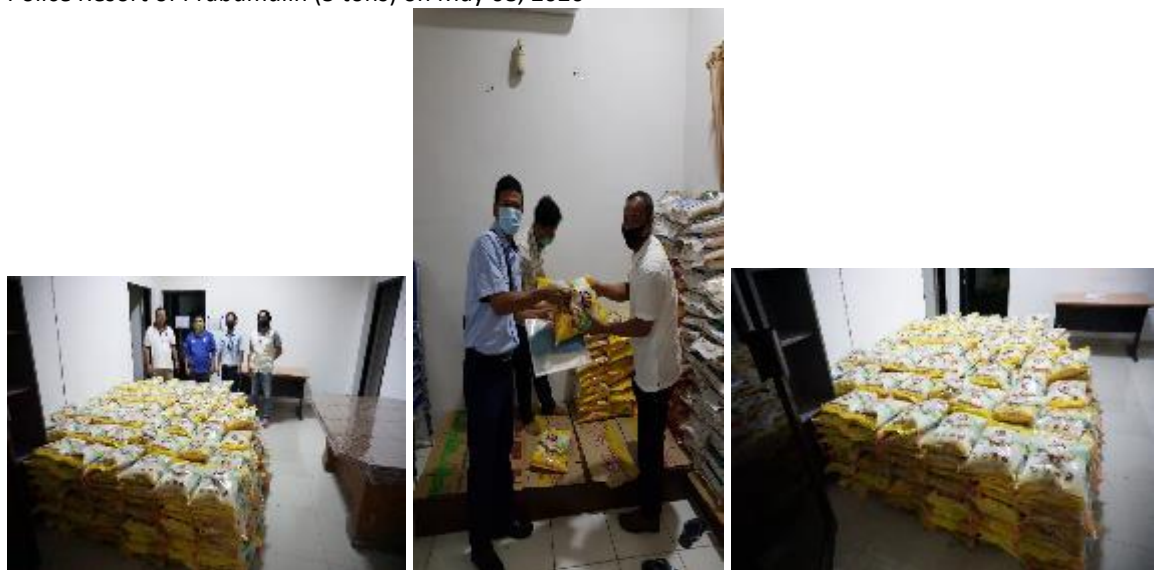
Handover the rice to Polres of Muara Enim (left) and to Polres of Prabumulih (center)

To support program of Indonesian Police (POLRI) to distribute rice to the community who impacted by covid-19, PT TEL had distributed 10 tons of rice which handed over to Police Resort of Muara Enim (5 tons) and Police Resort of Prabumulih (5 tons) on May 08, 2020