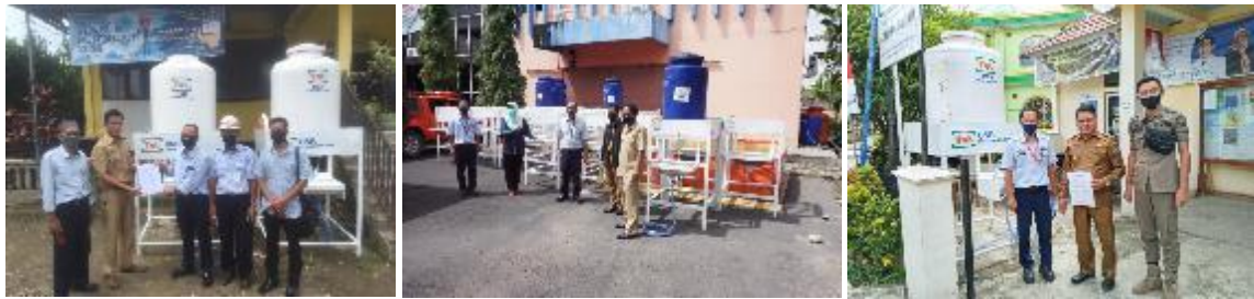
Distribution of water tank and handwashing facilities to Banuayu (left), Muara Enim (center) and Empat Petulai Dangku (right)

One of the recommended ways to prevent the spread of covid-19 is to wash hands with soap and running water. PT TEL has distributed 100 water tank units and wash basins to 28 villages area 1-3, 3 sub-districts, police and military institutions, Public Health Center and local governments (Muara Enim, and Prabumulih)