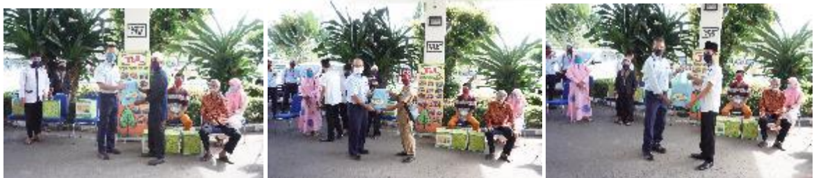
Symbolic distribution of moslem cloth and sarong to stakeholders