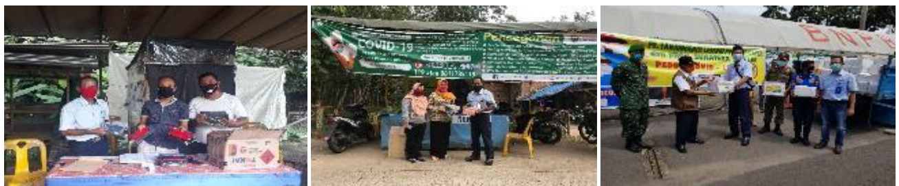
Distribution of cloth mask to Bulang (left), Kuripan Selatan (center) and South Sumatera (right)