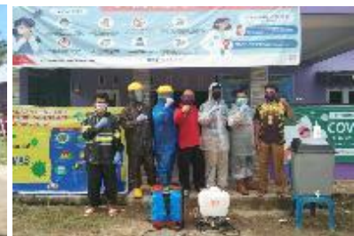
Post of covid-19 at Pangkalan Babat (left), Tanjung (center) and Banuayu village (right)