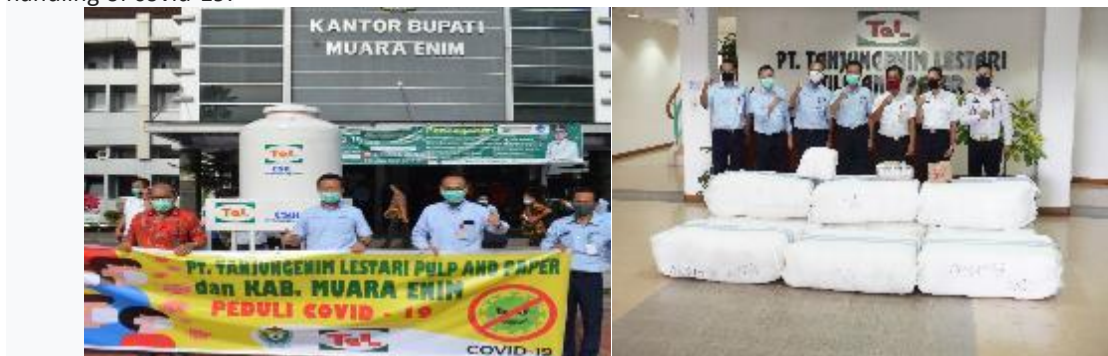
Symbolic handover of material for handling and preventing the covid-19 pandemic to Muara Enim Regency on April 22, 2020 (left) and to Prabumulih City on April 23, 2020 (right)

Since the covid-19 pandemic in Indonesia, specifically in South Sumatera region, PT TEL as company operating in South Sumatera area is committed to participate and contribute in supporting the government in prevention and handling of covid-19.