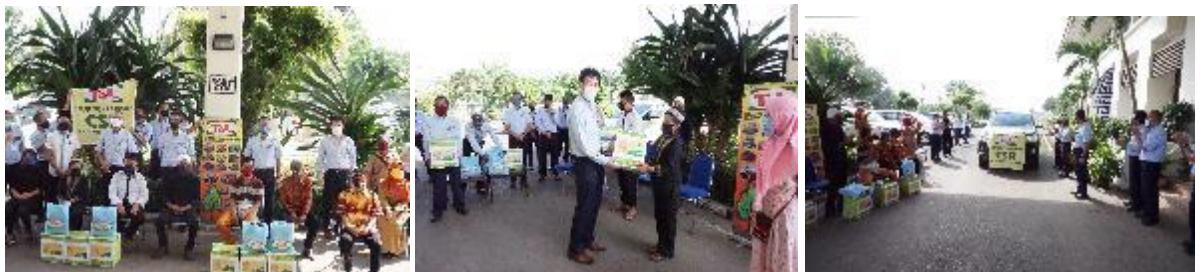
Symbolic distribution of Idul Fitri 2020 packages on May 14, 2020